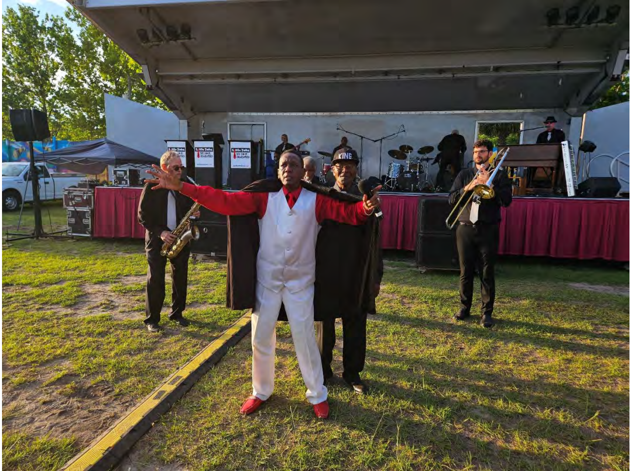
Lil Jake performs at the 44 th Annual 5 th Avenue Arts Festival